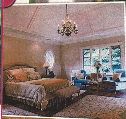
The French-style chateau has plenty of space for entertaining.